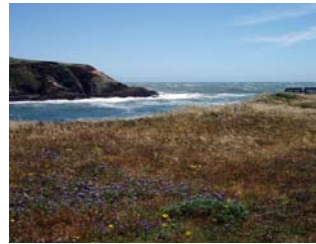
Spring time at the Bodega Marine Lab offers many beautiful colors.

Evolution, Ecology, and Biodiversity Peer Advisor. My office hours are posted in the EVE office,